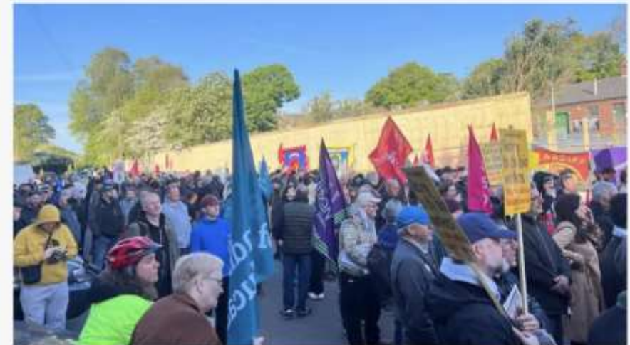
Union members have travelled from around the country to stand in solidarity with the city's refuse workers